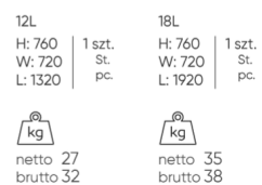
SNR TB 12L/18L

Dimensions are approximate and may vary depending on the selected product configuration. The requirements of the standard are always met.