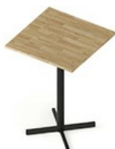
TB CS 80H