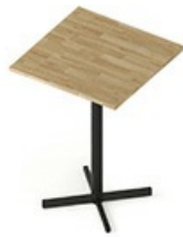
TB CS 80H