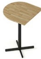
TB CSC 80H