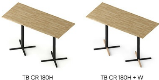
TB CR 180H