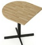
TB CSC 80