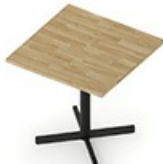
TB CS 80